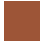
Santa Fe IC034