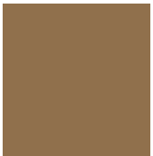
Dusty Tan IC052