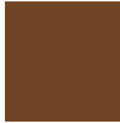
Brown Sand IC064