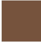
Rich Earth IC064